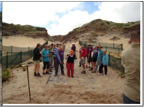
Track repair Fish Creek 09