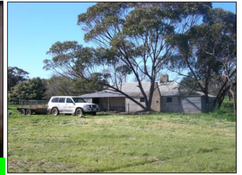
Youndegin police station restoration